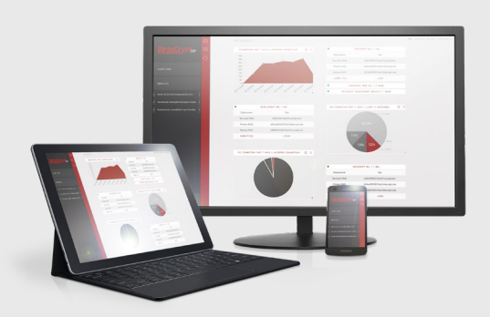
Futurex VirtuCrypt Intelligenge Portal (VIP)

Futurex's natively-integrated HSMs offer streamlined deployment and high security, with no 3rd party relationship management needed.